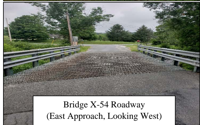
Bridge X-54 Roadway (East Approach, Looking West)